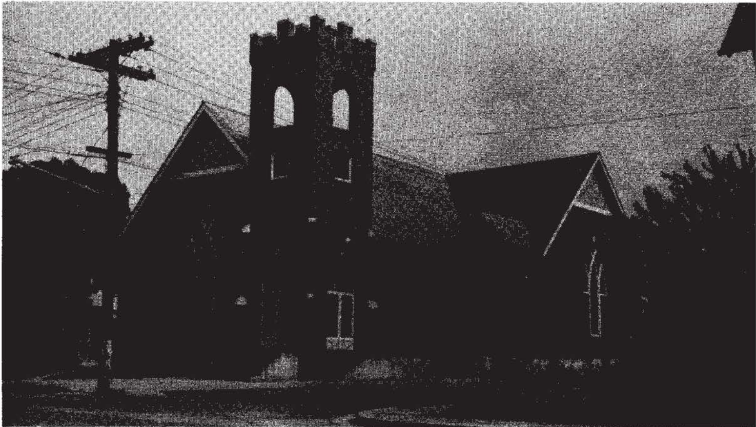
GRACE METHODIST CHURCH, GEORGETOWN (Page 288)