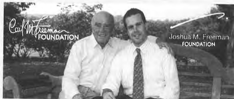
CARL M. FREEMAN FOUNDATION GIVING GRANTS AND GUIDANCE