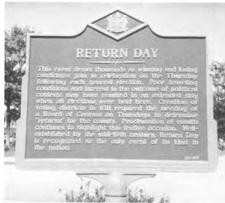
Quote from the Easton Md. Gazette November 8th 1878

John M. Clayton, Delaware U.S. Senator and U.S. Secretary of State in President Taylor's administration once said of Return Day "that the man who had been to a political meeting in Dagsboro, seen Return Day in Georgetown and visited Paris had witnessed the three most interesting sights in the world!"