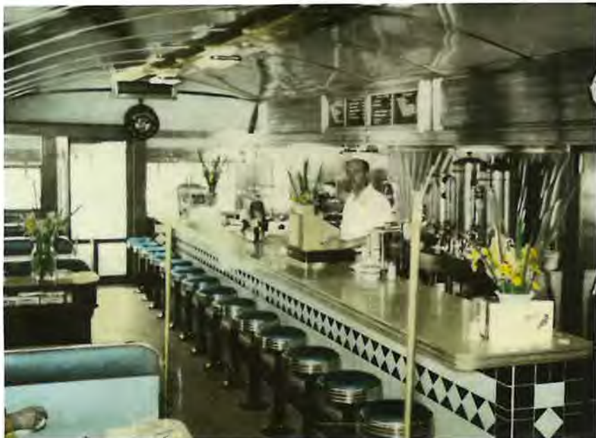
Vintage Postcard.