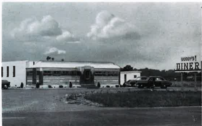
WOODY'S DINER — U. S. 113 — SELBYVILLE, DEL.