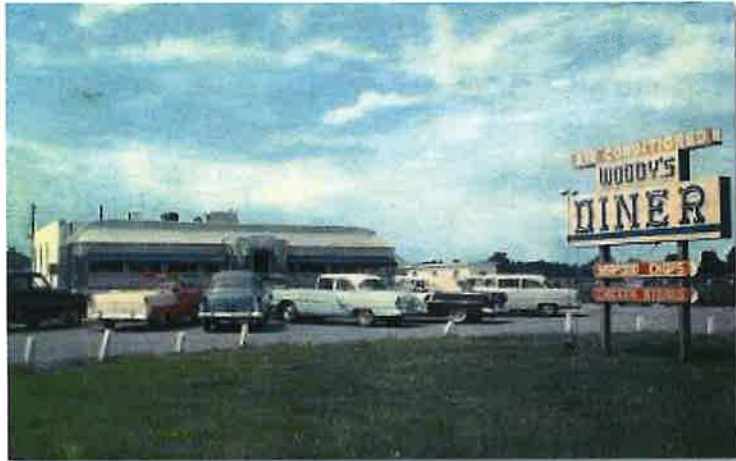
Vintage Postcard.

Doyle's Restaurant 38218 DuPont Blvd. Selbyville, Delaware 19975 302-436-2112