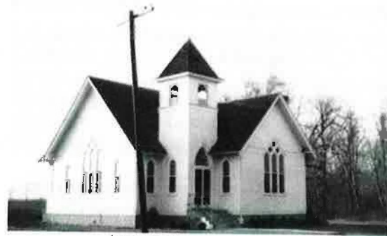
1941 - Zebly Collection

Zebly Mt. Zion Methodist Episcopal Church (M. E.) is located on the old Du Pont Highway three miles north of Laurel. The original church was built on the road to Bethel. The congregation was organized in 1809. On May 19, Matthias and Charles Moore deeded 81 square perches of land at Manlove's Grove to a board of trustees headed by Elzy Moore. The church was built and was called "Elzy Moore's Meeting-House," until 1825, when it was given the name "Wesley Chapel." The building was of frame construction. In 1852, the chapel was torn down and the congregation divided; one group organized Sailor's Bethel at Bethel and the second group organized Mt. Zion Church. For a short time the second group met in a district schoolhouse.