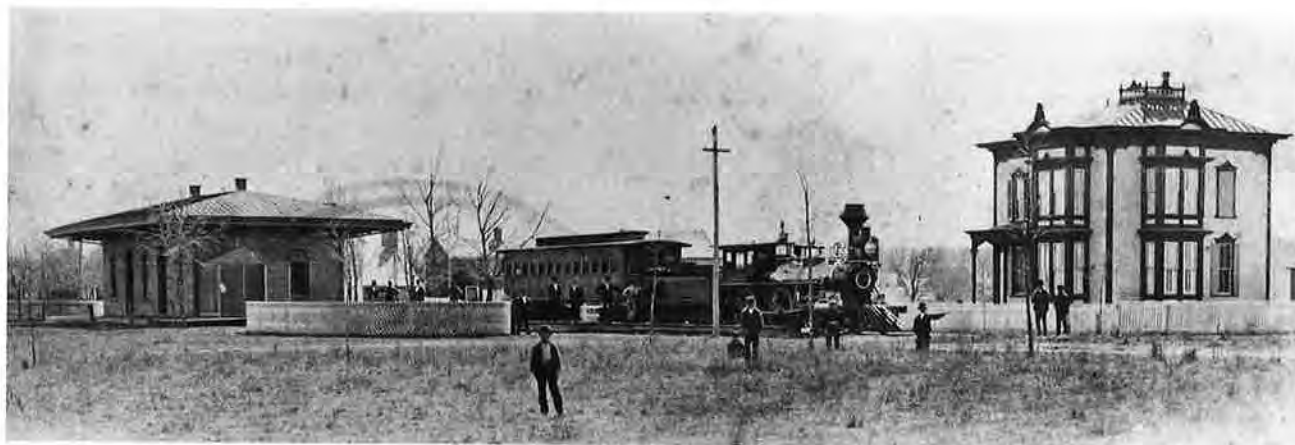
The Felton Railroad Station with a waiting train, circa 1873.

writer said, "he (the tax collector) was seldom home to blacks." 12