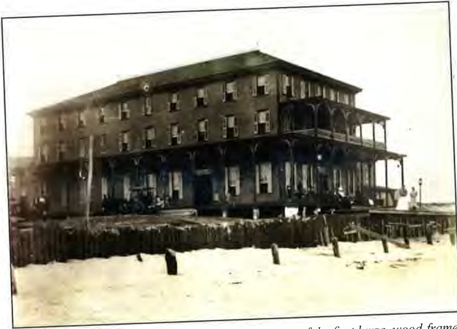
The Bright House hotel at Rehoboth Beach was one of the first large, wood-frame hotels of the resort's early days.