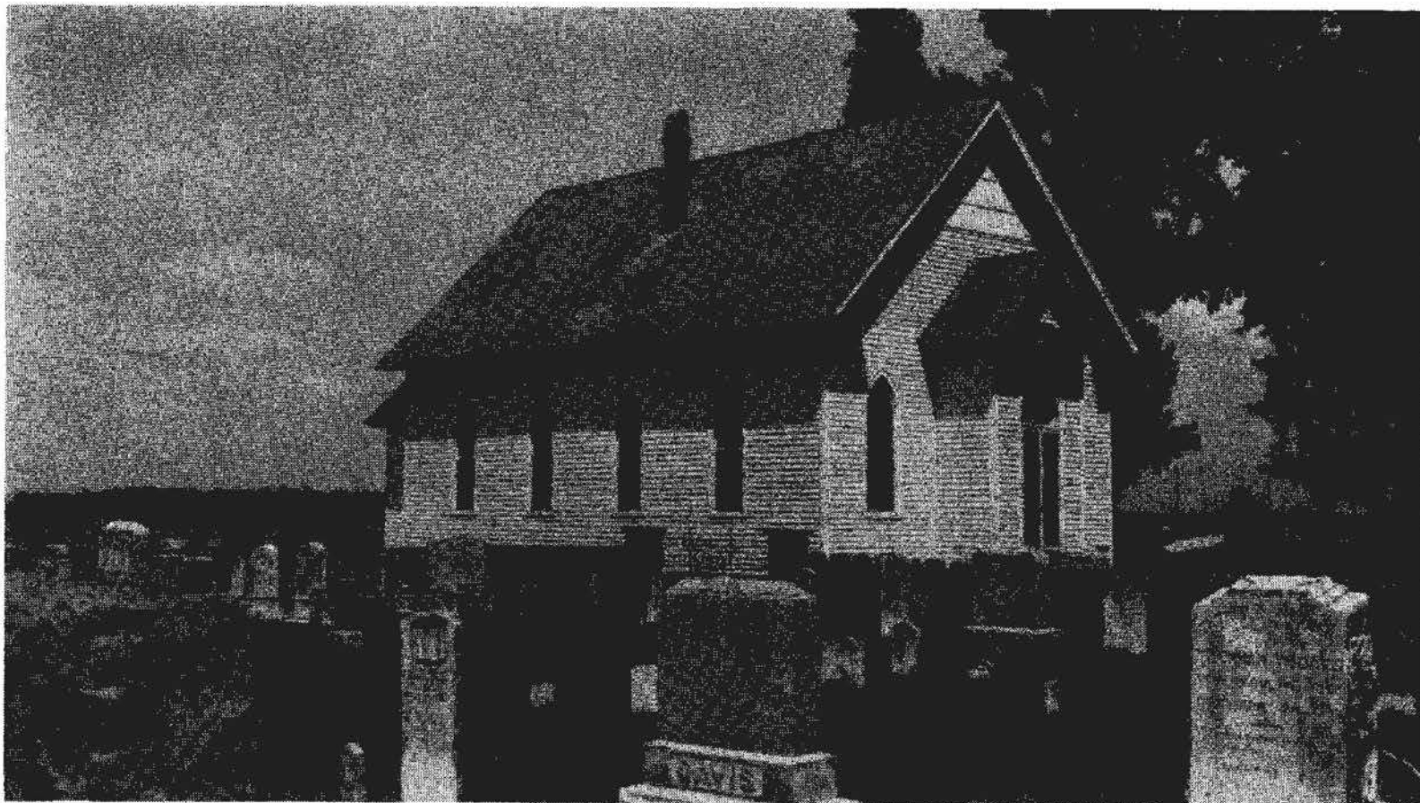
BETHEL METHODIST CHURCH, OAK GROVE (Page 330)