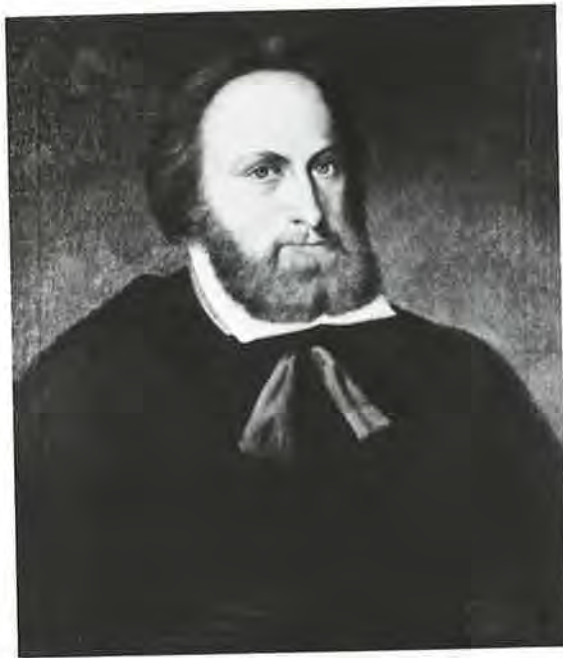
Thomas West, baron De La Warr, was governor of the colony of Virginia from 1610–11. The Delaware branch of the Lenapes, as well as the colony (now state) of Delaware, are named after him.

living in the fur-rich Ohio country. Many Lenapes, however, found their movements blocked by powerful tribes. To the south and west, the Seneca of the Five Nations and the independent Iroquoian-speaking Susquehannocks jealously guarded paths and rivers leading beyond the Appalachian Mountains to the rich trapping lands in the Ohio Valley. To the east, the Pequots stood between the Lenapes and abundant New England trapping grounds and well-stocked Boston traders. And to the north, the Mohawk and the Oneida of the Iroquoian-speaking Five