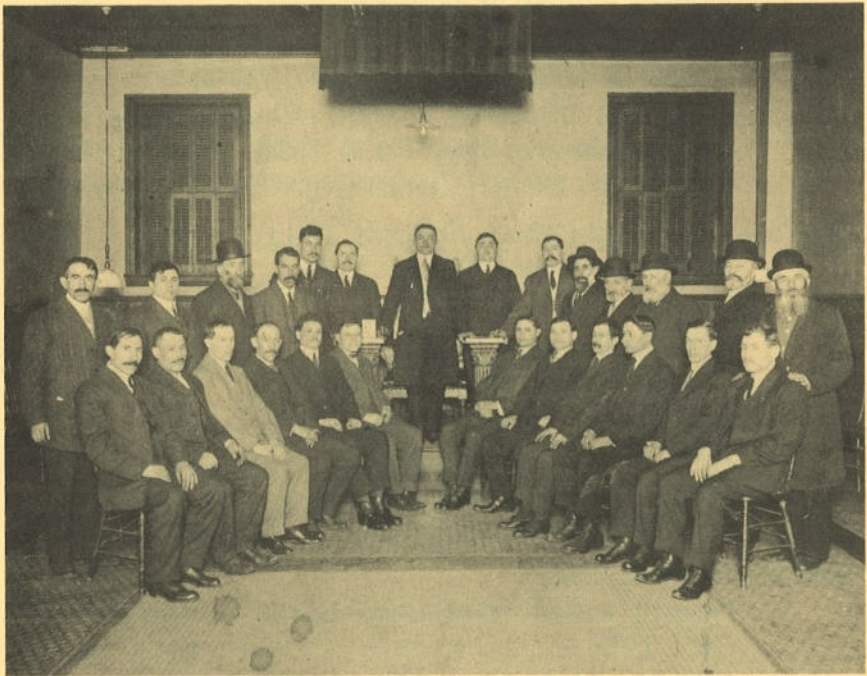
Chesed Shel Emeth early 1900's.