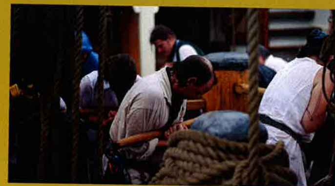
Surprisingly effective, these bilge pumps could discharge hundreds of gallons a minute.

They carried a whipstaff to move the massive rudder, which weighed 3,200 pounds. The whipstaff was the latest in helm technology until about 1710, when it was finally replaced by a steering wheel that operated the rudder through a complex system of ropes and pulleys. The whipstaff was a vertical lever attached to a horizontal lever, called the tiller, a long, shaped block of wood that ran through the wardroom cabins and out the stern where it attached to the rudder. A nifty gadget called a rowel – essentially a 17th-century version of a universal ball joint – allowed the whipstaff to pivot while connecting it to the tiller. The whipstaff and tiller combined to give a multiplicative 40:1 mechanical advantage, enabling a single sailor to handle the massive rudder, no matter how high the seas or bad the weather. Helm commands were given by officers standing on the quarterdeck, who conned the ship from a position where they could see the workings of the ship and where and how it was moving. In stormy conditions or in battle, a relay was used to pass the commands from the officers to the helmsman. It took teamwork and constant attention, but it worked remarkably well – and still works today.