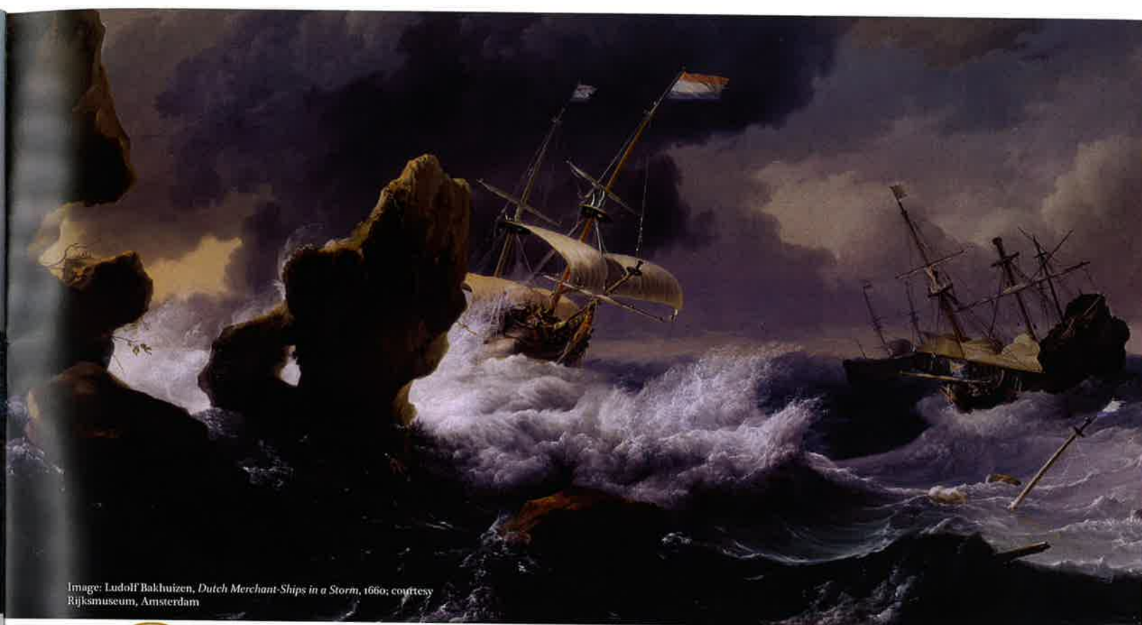
Image: Ludolf Bakhuizen, Dutch Merchant Ships in a Storm , 1660

A traverse board was used for dead reckoning, recording the ship's last known position, course, and speed. Dead reckoning required careful plotting, because getting from point "A" to point "B" was never straightforward, and allowances had to be made for wind drift and ocean currents. The term "dead reckoning" – "dead" here meaning "completely" or "absolutely," as in "dead wrong" or "dead last" – comes from open ocean sailing, where mariners had to rely entirely on calculation once they were beyond the sight of land. 1