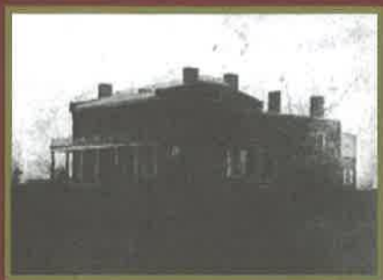
Photographic view of Buena Vista R. M. Bird 1852