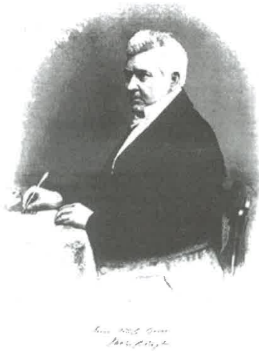
JOHN M. CLAYTON (1796-1856)

John Clayton purchased 325 acres of land for $12,500.00 on March 26, 1845. We don't know who built the house. He appeared to be living in "his new home on the State Road below Hare's Corner" later that year. By April 18, 1847, he referred to home as "Buena Vista" in honor of General Zachary Taylor's victory during the Mexican War.