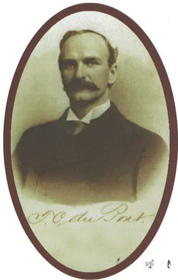
T. COLEMAN DUPONT (1863-1930)

Born in Kentucky, Coleman duPont had already made his fortune in steel, coal, and street railways when he moved to Delaware in 1900. In 1902 he joined his cousins Alfred I. and Pierre S. duPont in taking over control of and incorporating the Dupont Company. Coleman served as President of the Dupont Company from 1902 to 1915. He was elected to the U.S. Senate in 1924 and was also the founder of the Wilmington Trust Company.