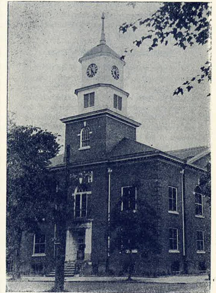
Kent County Court House

Issued by DOVER CHAMBER OF COMMERCE Dover, Delaware