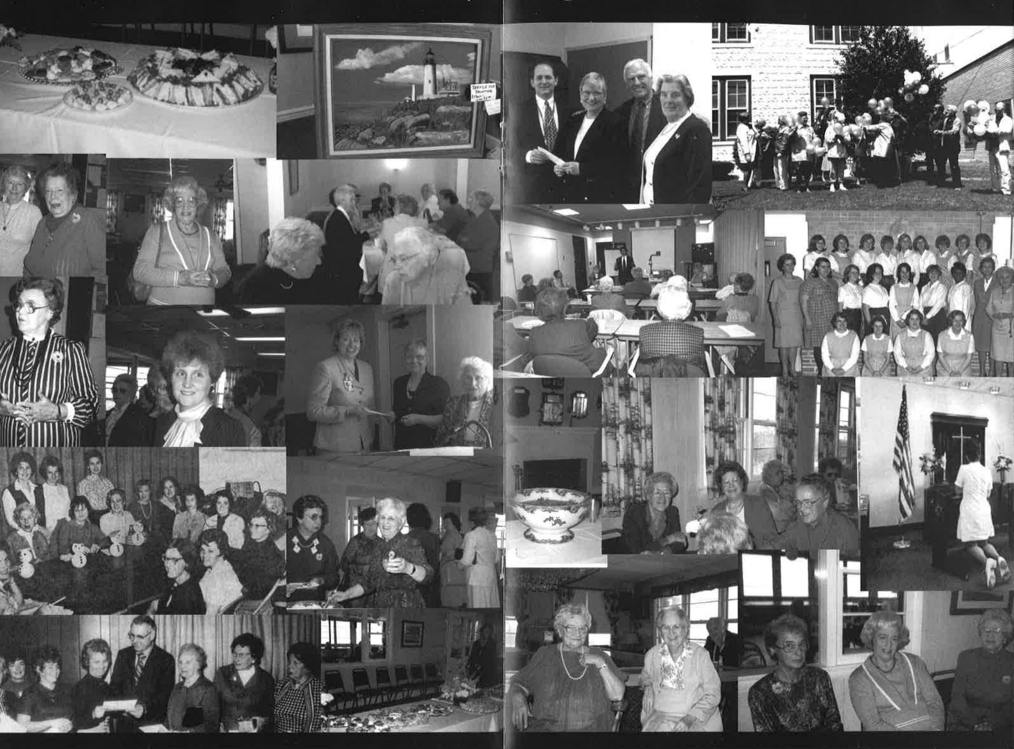
Beebe Auxiliary Through The Years