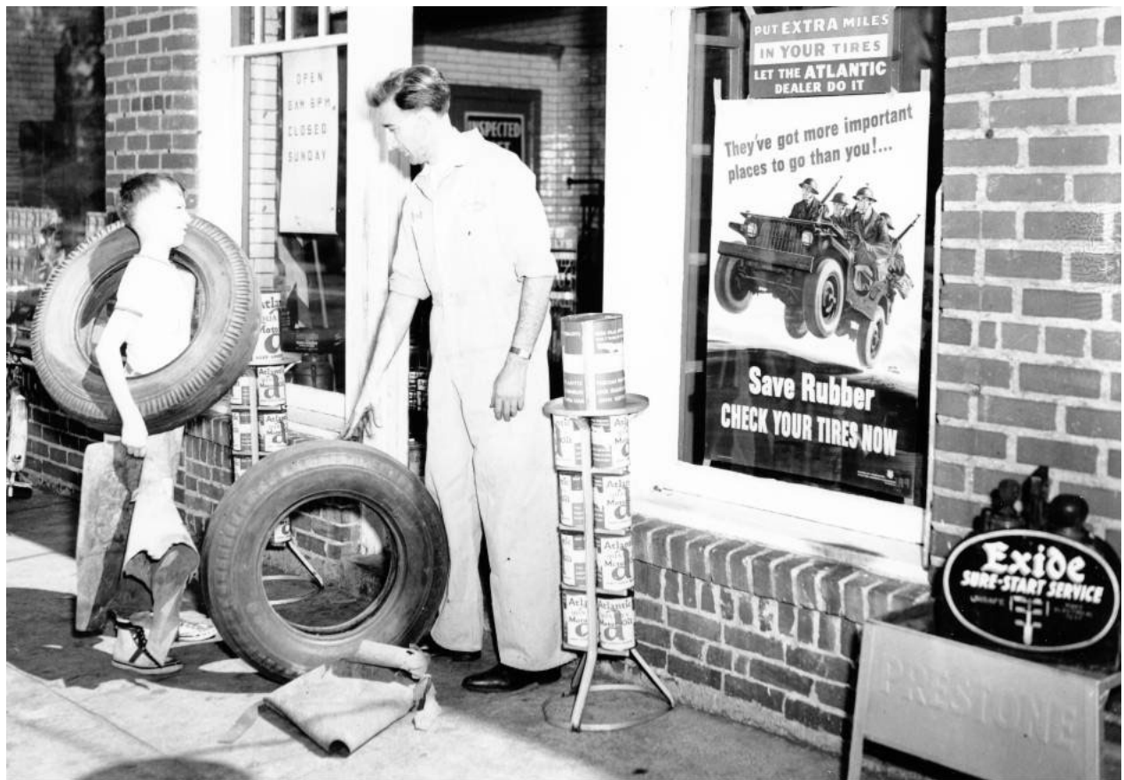
Delaware Public Archives