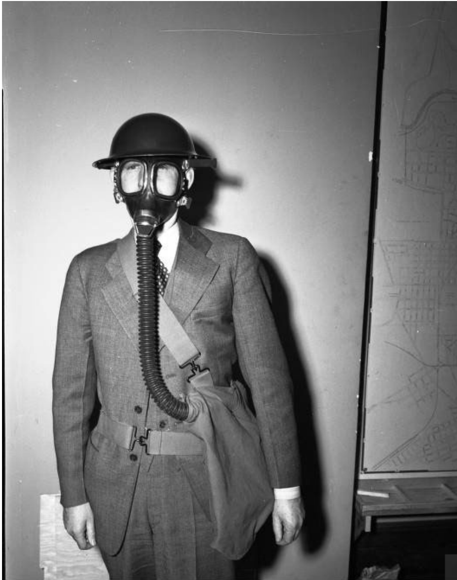
Delaware Public Archives