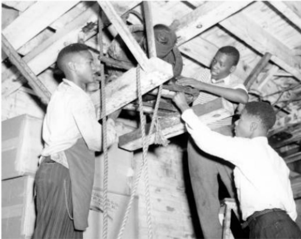
Delaware Public Archives